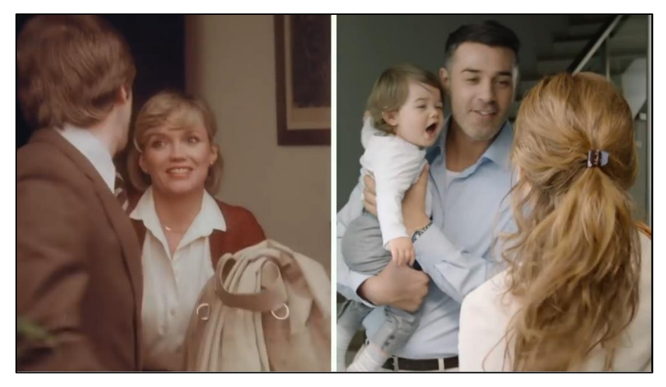
Fig. (1): Allianz Klassiker / Unfall (2015)

In the contemporary remake of the commercial called Unfall , which translates to Accident , the woman is depicted as preparing to leave for work while the father stays at home with the child (Fig. 1). According to Zimmerman (2021) this challenges gender roles that are typically associated with parenting responsibilities.