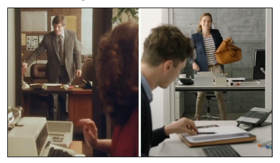
Fig. (4): Allianz Klassiker / Unfall (2015)

The same commercial subsequently depicts a contemporary remake of an office environment, where the woman is portrayed as the manager and the man is the secretary (Fig. 4), which challenges gender roles traditionally associated with the workplace.