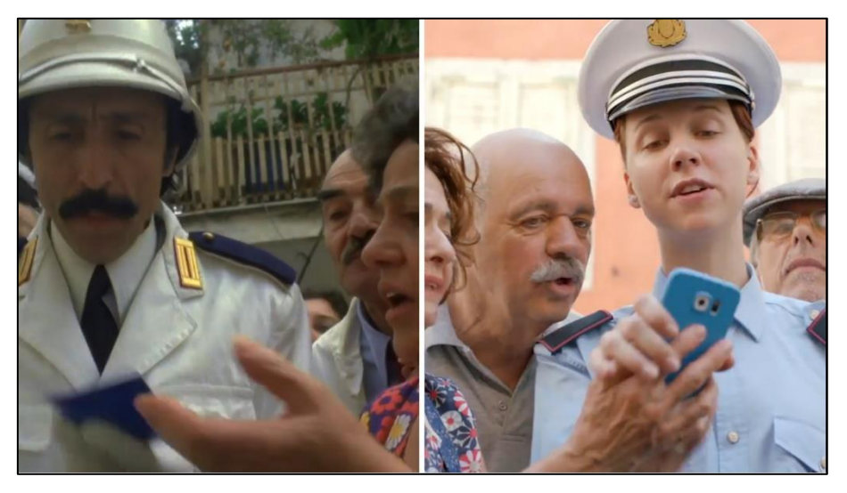
Fig. (5): Allianz Klassiker / Tomatenstapel (2015)

In the second commercial, which is titled Tomatenstapel and translates to Pile of Tomatoes , the police officer is portrayed by a woman (Fig. 5). This depiction challenges the typical gender roles that are traditionally associated with law enforcement professions. This portrayal implies that women are equally capable of serving and protecting their communities and pursuing careers in traditionally male-dominated professions, which contrasts with traditional gender stereotypes that typically depict police officers as men.