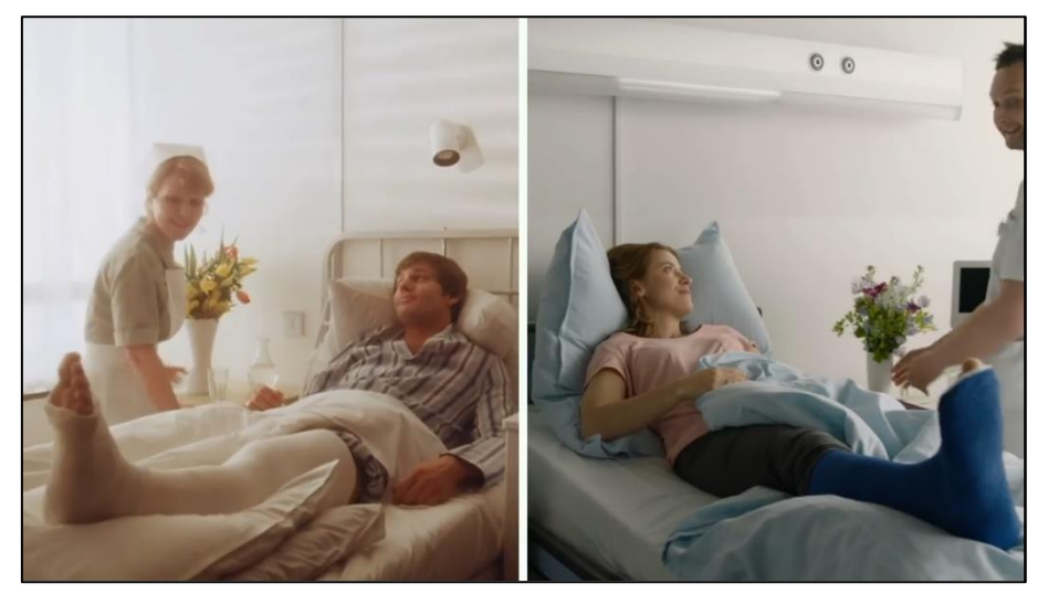
Fig. (2): Allianz Klassiker / Unfall (2015)

In the same commercial, a later sequence depicts a contemporary remake of a hospital scene, which features a male playing the role of the nurse (Fig. 2). This representation challenges traditional gender roles and stereotypes typically associated with healthcare professions.