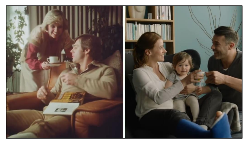
Fig. (3): Allianz Klassiker / Unfall (2015)

This portrayal challenges traditional gender roles and emphasizes the importance of care and support within a partnership, regardless of gender. Traditionally, women were expected to take on the nurturing and caregiving roles within the household. This scene demonstrates a shift toward a more supportive and balanced household dynamic, where the man occupies the role of providing care and comfort to the woman. It highlights the importance of empathy, emotional support, and mutual understanding within relationships regardless of societal gender-based expectations. These acts of care and support should not be limited to just one gender.