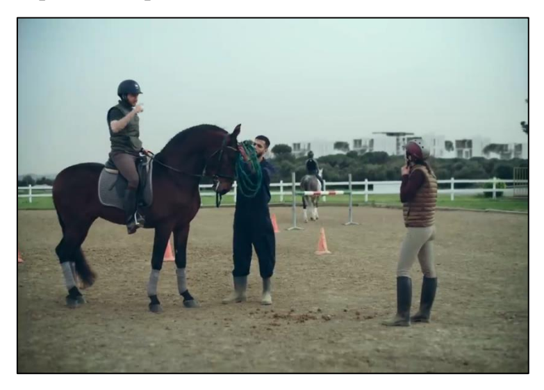
Fig. (8): Badya Stories / The One with the Horse (2022)

often traditionally seen as a more masculine activity associated with the cavalry in old ancient times. Hashem jokingly asks her if she her name is Gomaa, a male's name, which reflects the traditional gender stereotypes and expectations. As a result, this scenario presents an opportunity for the man to challenge his preconceived notions and remain amenable to receiving riding instructions from a female coach (Fig. 8). This portrayal challenges gender norms and highlights the idea that anyone, regardless of their gender, can pursue an occupation in sports.